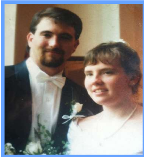
Sample Picture from a loooooong time ago but feel free to guess who!?!?

Think you could fool people most of the time? Drop a photo in the red newsletter mailbox – but include a little blurb with a few hints. Also please identify yourself. The newsletter editors can keep a secret – most of the time! (Only foolin' folks. We promise to zip our lips.)