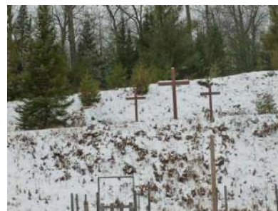
Our Crosses on the Hill