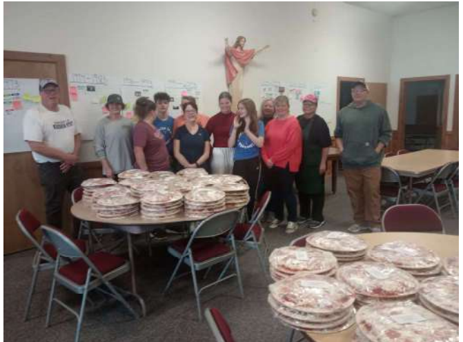
The Whole Pizza Pie Bunch!!